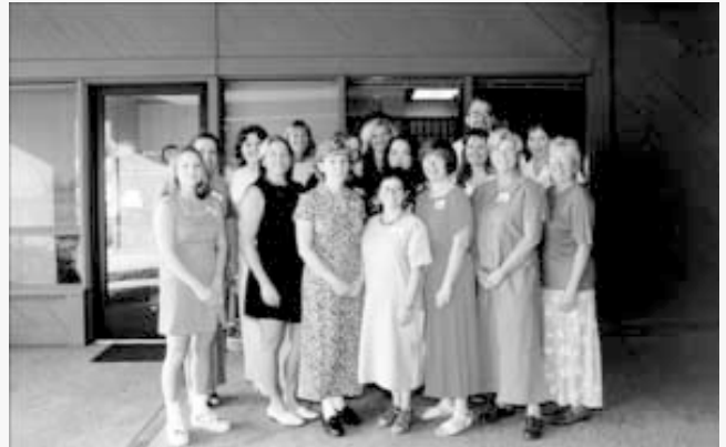
The staff of Great Beginnings FRC in Shasta County standing proudly in front of their center at their grand opening on 9/16/99.