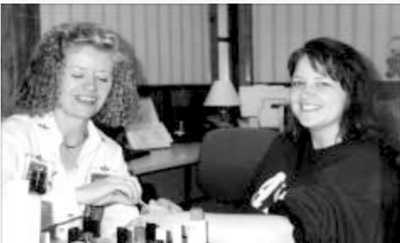
Pampering Day at an ABC site in Lake County is a day dedicated to thanking the families that participate in their programs. Activities include haircuts and styling, facials and manicures. All of the services are donated by local establishments.