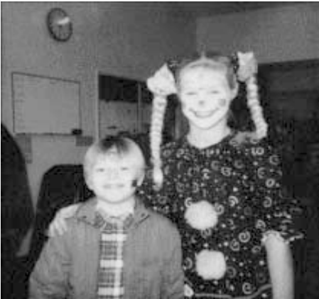
Yuba County recently held an open house at the Olivehurst Center. It was a huge success. There were games for kids and a ribbon cutting ceremony. A good time was had by all as you can see by the smiling faces in the picture above.

To ensure a high quality standard, OCAP has incorporated the California Safe and Healthy Families (CalSAHF) and Family Resource Center Core training program into the ABC Initiative. The OCJP/VOCA funding provides treatment services for abused children 0-18.